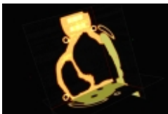
Tri-planar rendering through one phase of a dynamic 3D CT scan of the heart phantom.